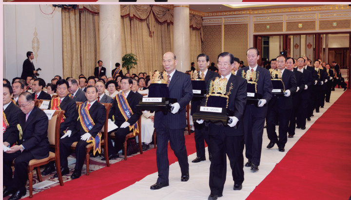
(Clockwise from above) National flags from countries specified by True Father are exchanged for a Parent UN flag; The nomination of True Parents is presented on a plaque; Representatives of religions present scriptures; Clan representatives offer crowns.

Third, the peace king representatives ( boonbong-wangs ) and the Parent UN will be placed at the forefront of the efforts to completely eliminate the walls and barriers that traverse the earth in multiple layers and to reinstate harmony and peace between political parties, religions, races, cultures and nations. The existing UN (in the position of the Cain-type UN) and the Abel-type UN should become one and reach a higher dimension, becoming the Parent UN—in other words, the Peace UN. Centering on the Peace UN, war, disease, hunger and all other problems confronting the world will be addressed and resolved. This is surely the direction all people must go. They will have no choice because God and True Parents will be with them. Individualistic self-centeredness as well as collective self-centeredness will be eradicated. This will lead to the realization of a world governed by our conscience and natural reason with no need for the election of leaders.