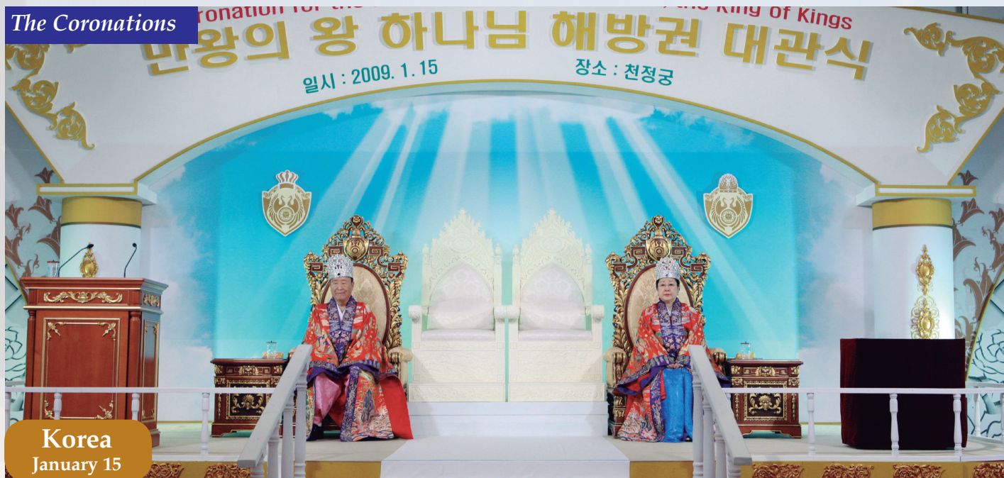
Korea January 15