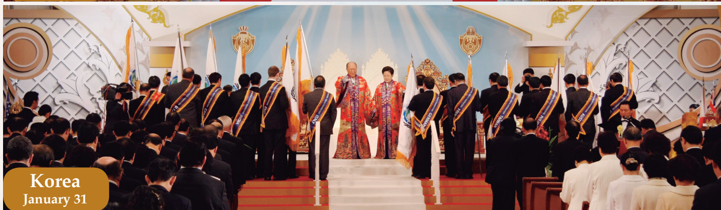
Korea January 31