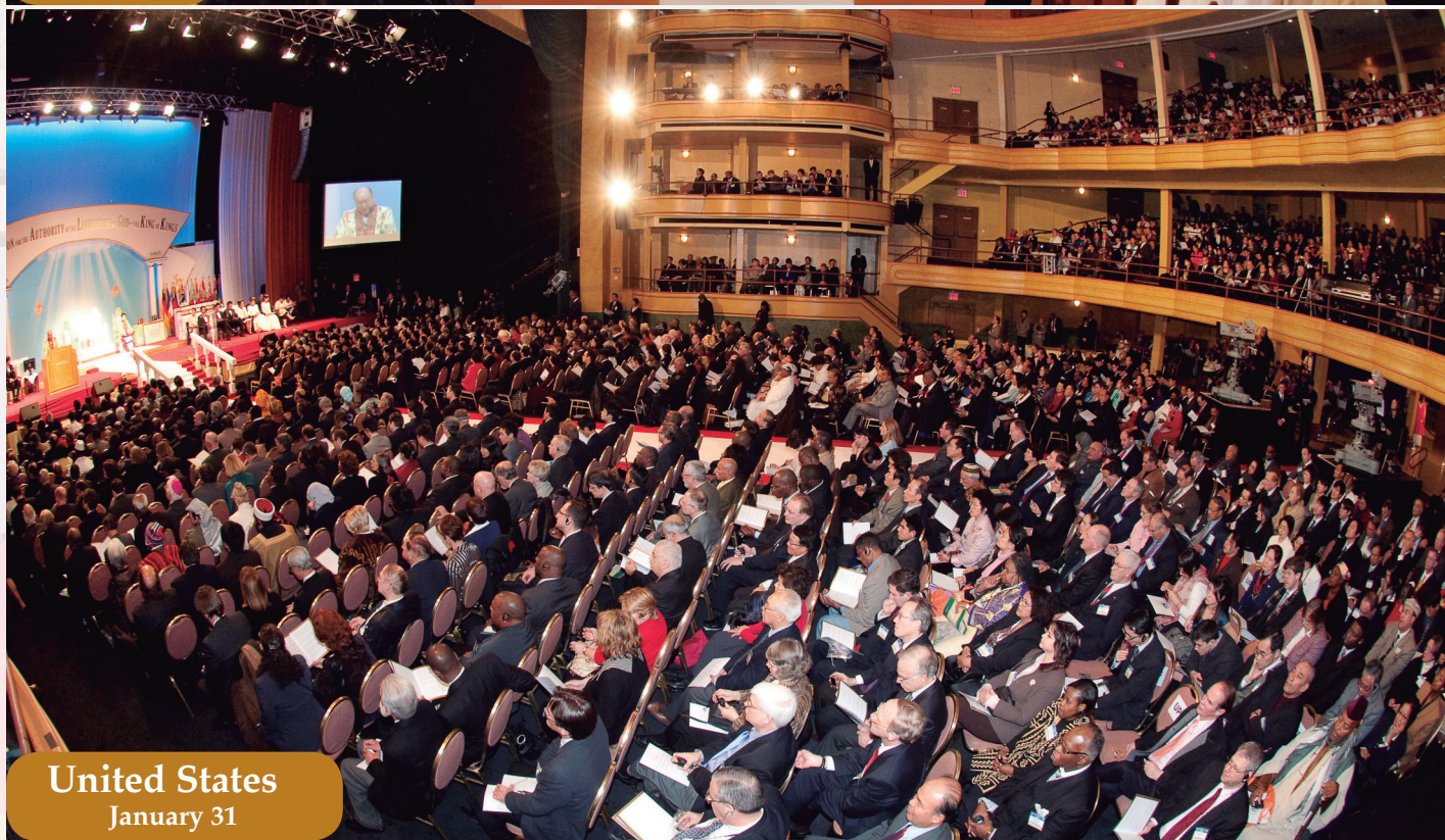
United States January 31